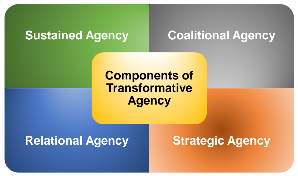
Figure 2: Core Components of Transformative Agency

may not always be simple ways for marginalized youth to "navigate plural, intersecting structures of power, including, for example, neoliberal economic change, governmental disciplinary regimes, and global hierarchies of educational capital" (Jeffrey, 2012, p. 246); however, the undertaking of strategic and deliberate analyses of future action is a core component of transformative agency as illustrated in Figure 2 along with the other three dimensions.